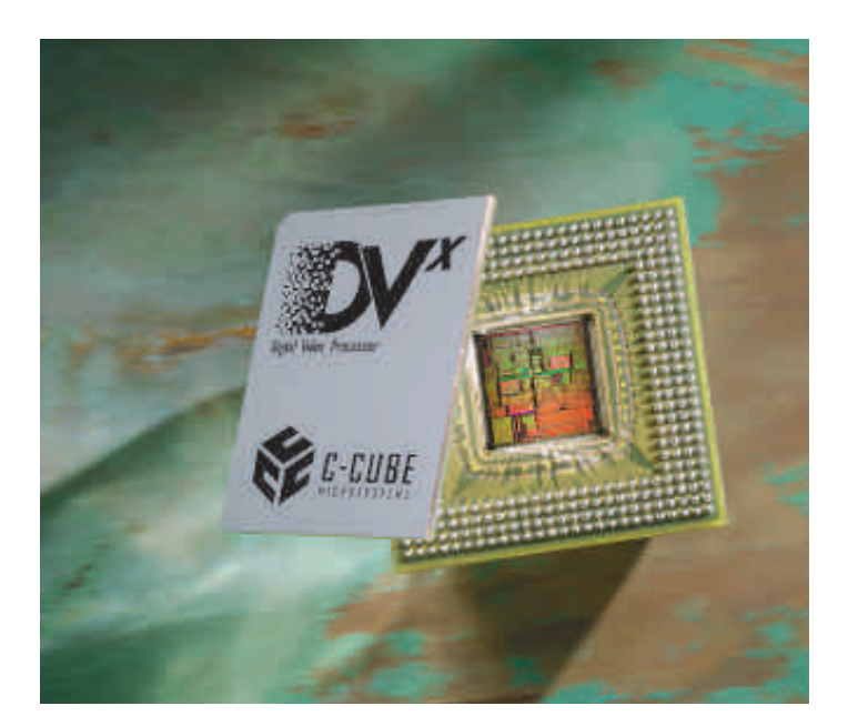
DV<sup>x</sup> Digital Video Processor

Using C-Cube's leading-edge PerfectView<sup>™</sup> encoding algorithm, DV<sup>x</sup> digital video processors deliver the highest quality 4:2:0 and 4:2:2 MPEG-2 images available today at significant bit rate savings. What's more, the single-chip implementation enables product designs that reduce cost, increase reliability, and speed time to market.